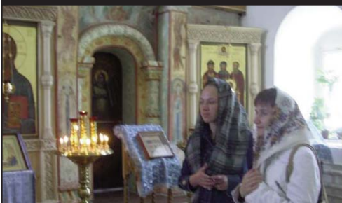
Heads Covered in the Sanctuary