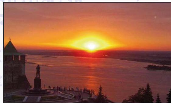
Near Midnight Sunset in Nizhny Novgorod

(Please see the "Just the Facts" article on page 6 for totals.)