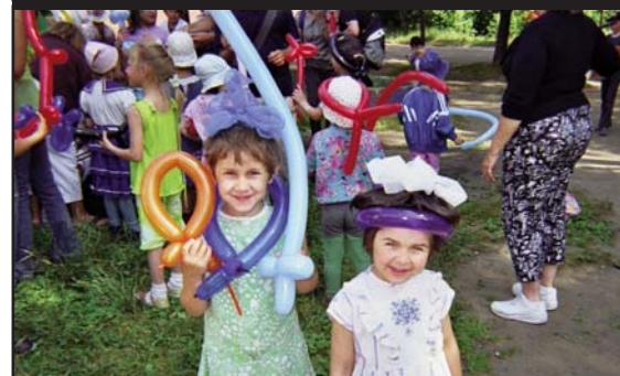
More Balloons for the Children