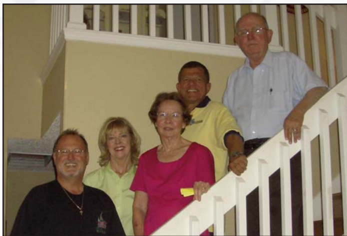
South American Team

MORE TRIPS 2008: Plans are for more international training in South America, Central America, and in Russia for next year.