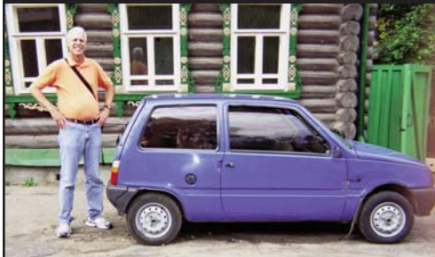
Brent Won't Fit