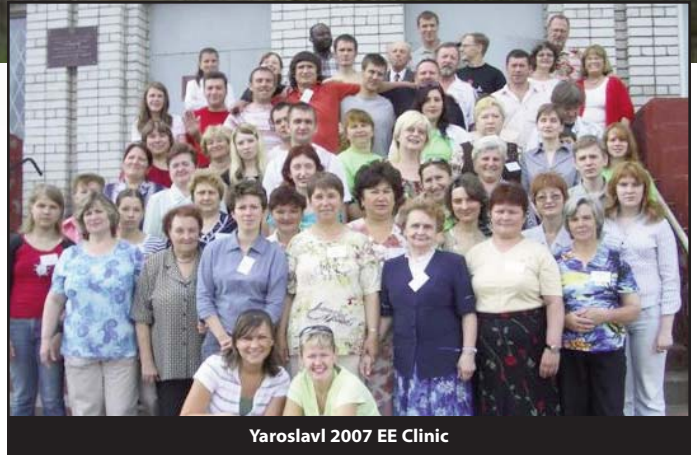
Yaroslavl 2007 EE Clinic

Saturday was a day of rest and touring Ooglish, an old city from the 1500's near Yaroslavl. There the team visited with a small sister church and visited the downtown area and cathedral. It was a lovely town and the team was able to see a traditional wedding celebration. After the ceremony in the cathedral, the groom carried the bride across the bridge, circled the down-