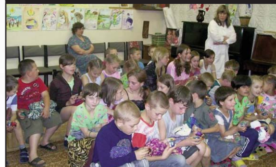
Orphans Receive Gifts