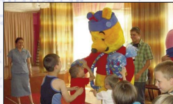
Body Puppets Hold Children's Attention

(Please see the "Just the Facts" article on page 6 for totals.)