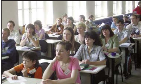
Ivanovo Clinic Attendees in Class