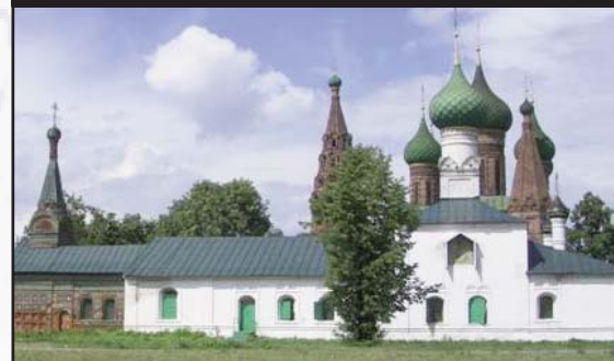
Cathedral in Yaroslavl