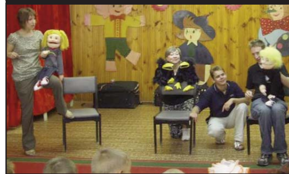
Puppets Minister to Orphans