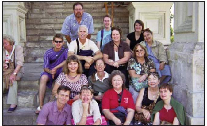
LMI Team on St. Basil's Steps