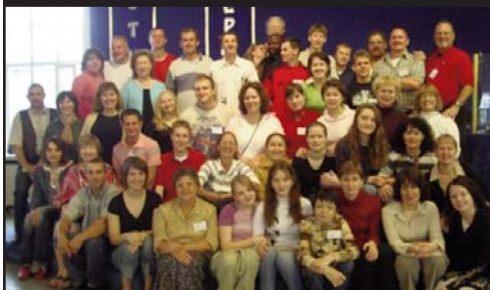
Ivanovo 2007 EE Clinic