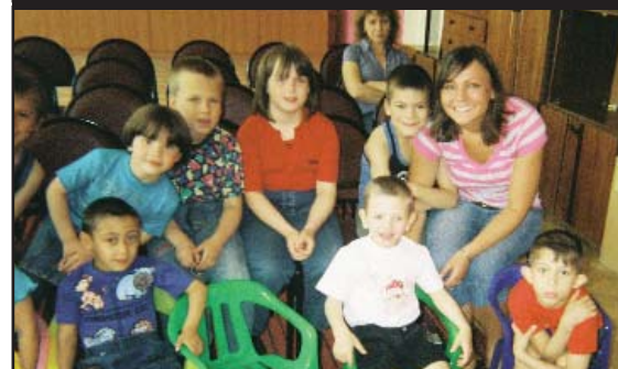
Diana with Orphans