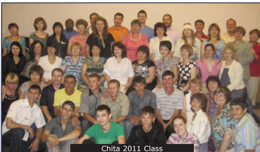
Chita 2011 Class