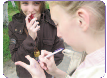
BANQUET PLANS PG. 4