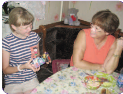
CHITA (SIBERIA) PG. 3