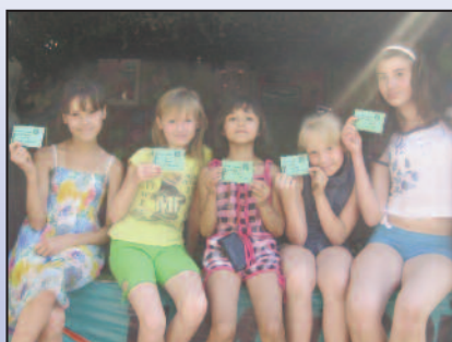
Park girls get tracks