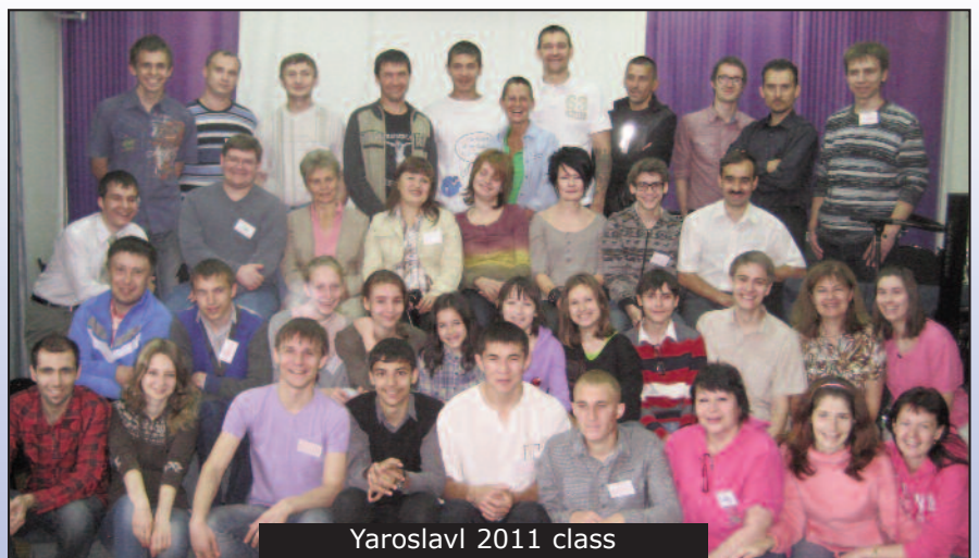
Yaroslavl 2011 class