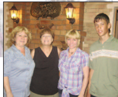
Restaurant owner gets Jesus