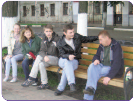
YAROSLAVL, RUSSIA PG. 2