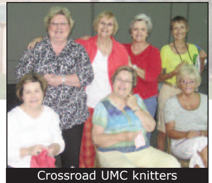
Crossroad UMC knitters