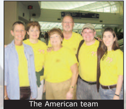
The American team