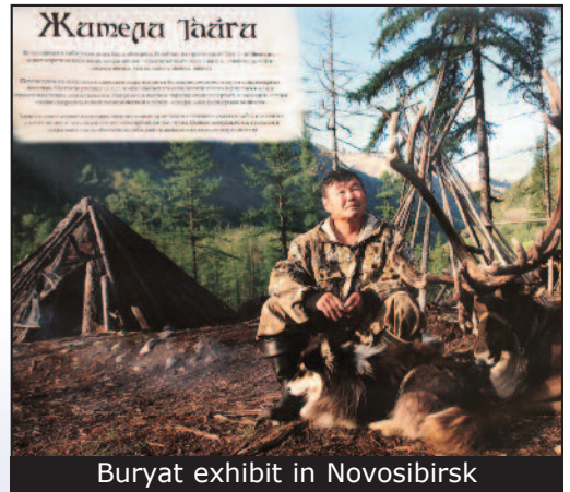
Buryat exhibit in Novosibirsk