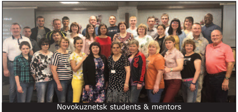
Novokuznetsk students & mentors