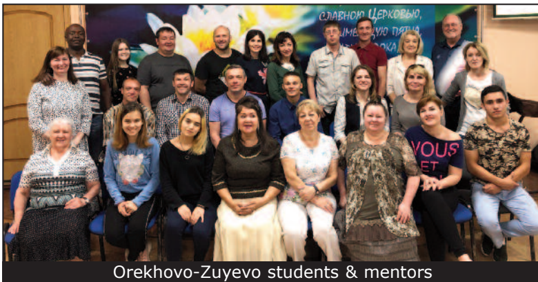
Orekhovo-Zuyevo students & mentors