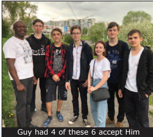
Guy had 4 of these 6 accept Him