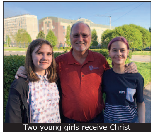
Two young girls receive Christ