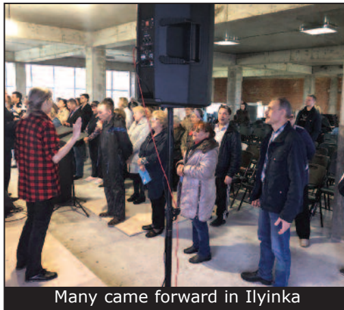
Many came forward in Ilyinka