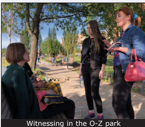
Witnessing in the O-Z park