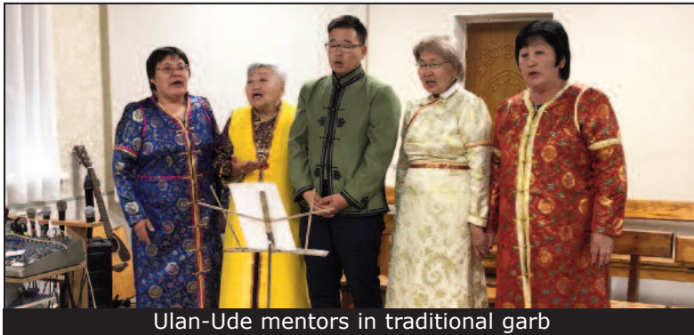
Ulan-Ude mentors in traditional garb