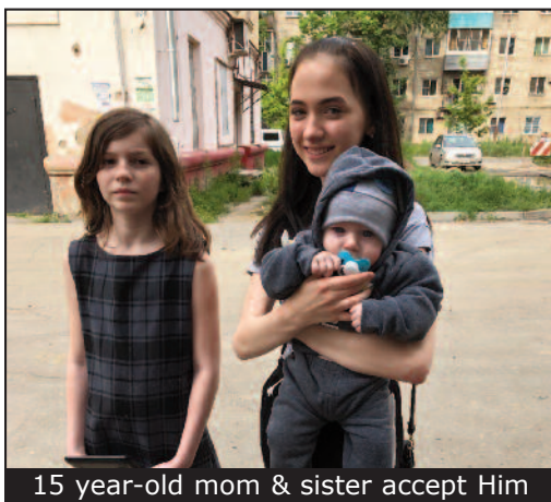
15 year-old mom & sister accept Him