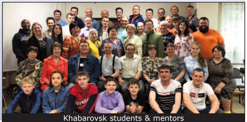
Khabarovsk students & mentors