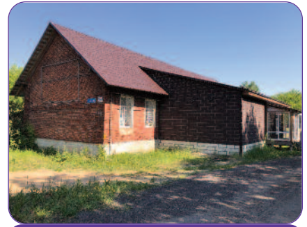
JUST THE FACTS