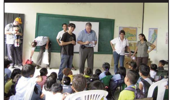
LMI Team at School