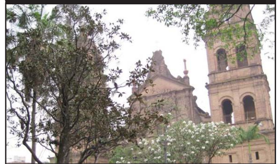
Santa Cruz Main Catholic Cathedral