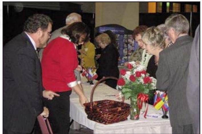
2007 Vision Banquet