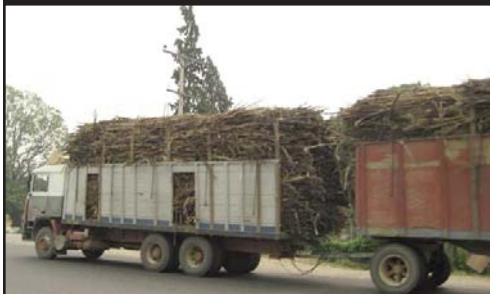
Truckloads of Sugar Cane