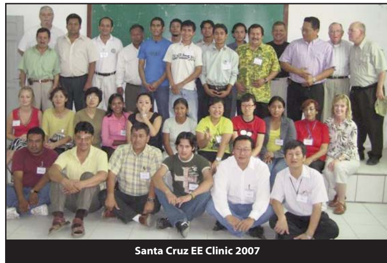
Santa Cruz EE Clinic 2007