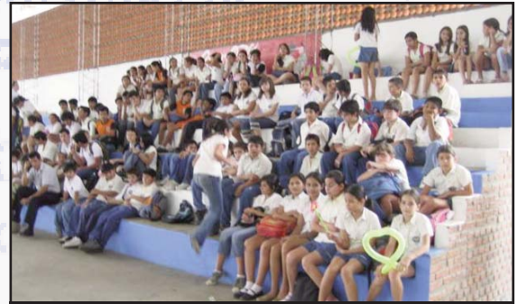
Assembled Children Hear the Gospel

(Please see the "Just the Facts" article on page 6 for totals.)