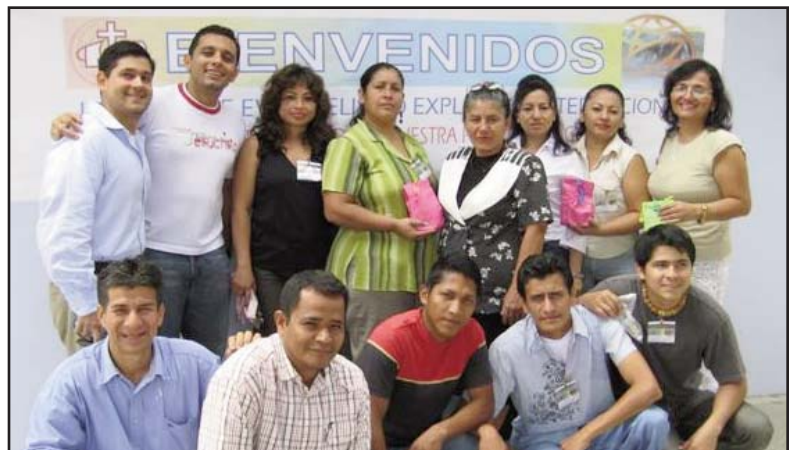
Portoviejo 2007 EE Clinic