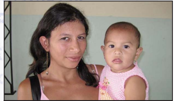
Mother and Child at a Medical Clinic

(Please see the "Just the Facts" article on page 6 for totals.)