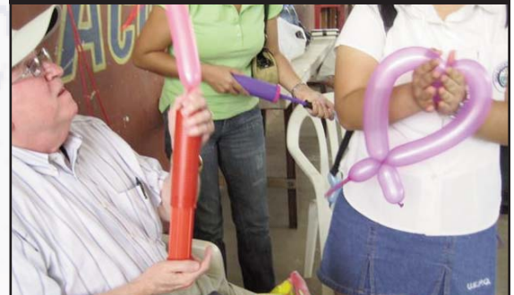
Billy's Balloon Ministry