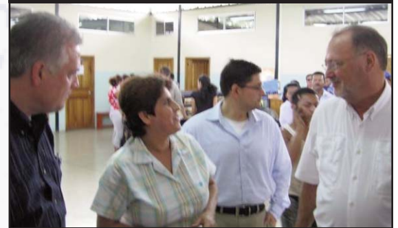
Church Sponsored Free Medical Clinic