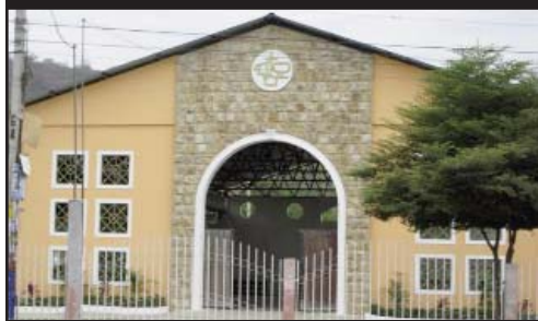
Templo Metropolitano Alianza