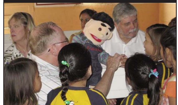
Randy's Puppet Ministry