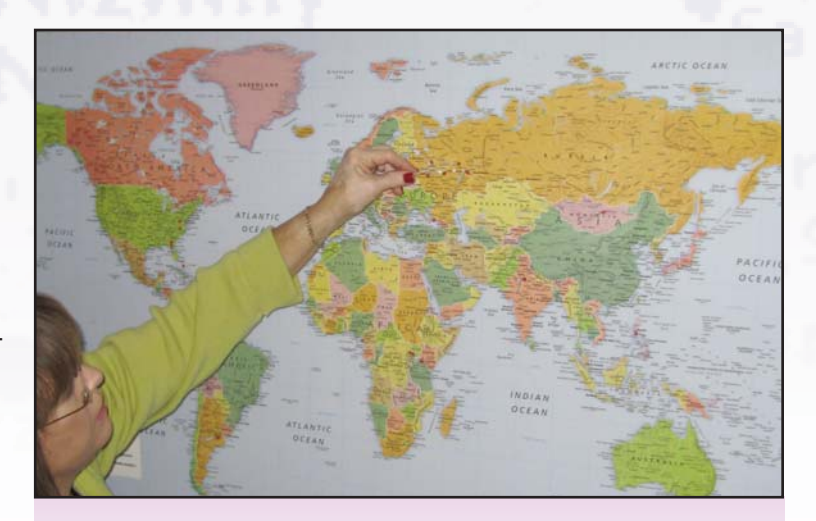
Will You Help Us?

Macas and Playas, Ecuador, will host training for two weeks in mid-September. LMI will be working with Christian Missionary Alliance pastors and churches as in 2006 in the city of Portaviejo.