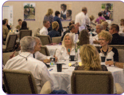
LMI GALA PG. 3