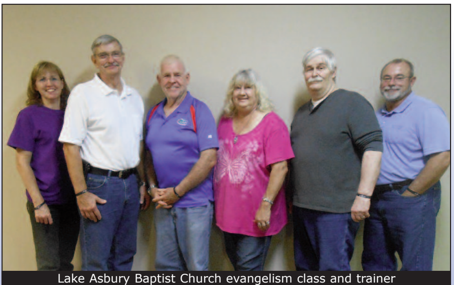
Lake Asbury Baptist Church evangelism class and trainer