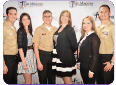
JUST THE FACTS PG. 4