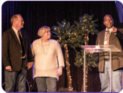
EVANGELISM PG. 2