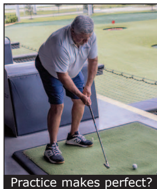
Practice makes perfect?