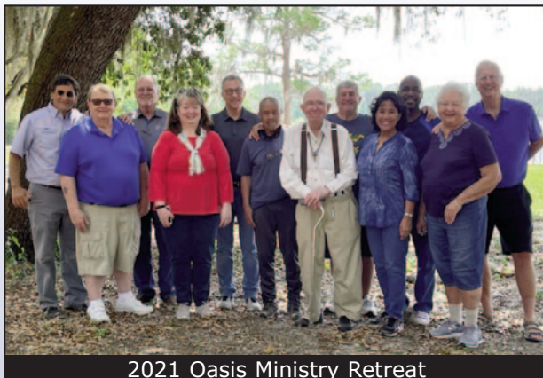
2021 Oasis Ministry Retreat

fast) were served cafeteria style by the cheerful staff in the nearby dining hall.