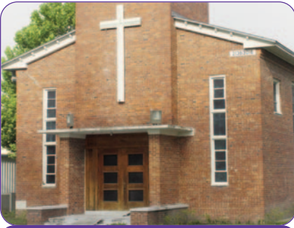
UCI & NJCOG