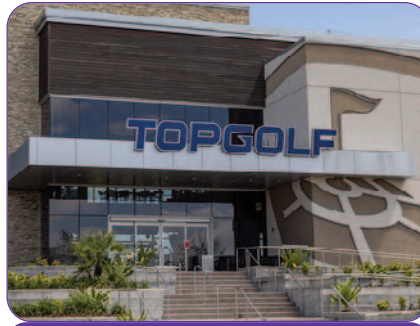
LMI @ TOPGOLF