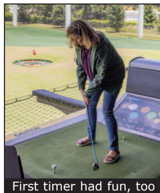
First timer had fun, too