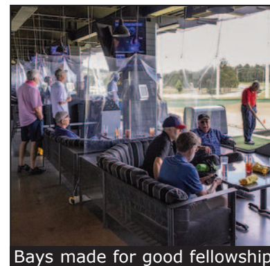
Bays made for good fellowship