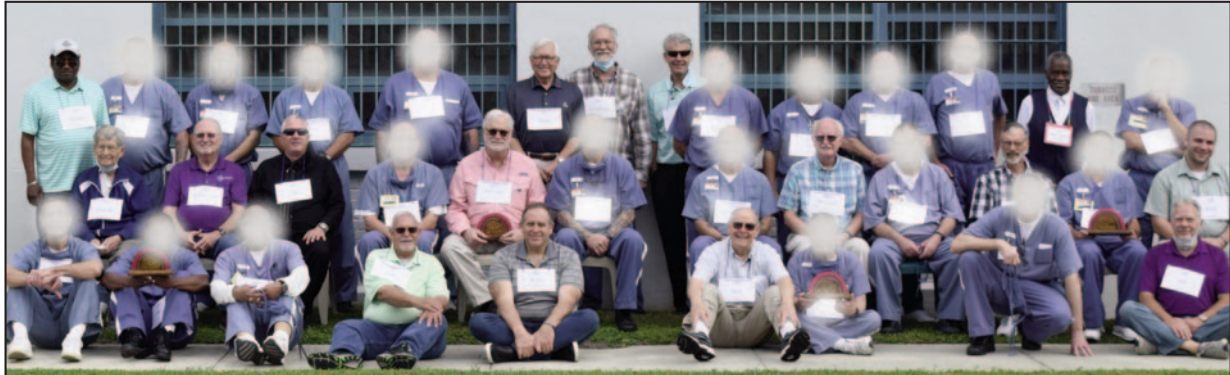
Kairos #88 at Union Correctional Institution (UCI)

[RAIFORD, FL] A team of 24 (16 pictured above) outside laymen and clergy began their preparatory training at freedom Christian Fellowship, 3423 Loretto Rd., Jacksonville, FL 32223, in February 2020. Due to the Covid-19 pandemic the class was suspended until the Spring 2021. The training classes resumed in February and the team entered UCI for a 4-day Kairos event March 26 - 30.