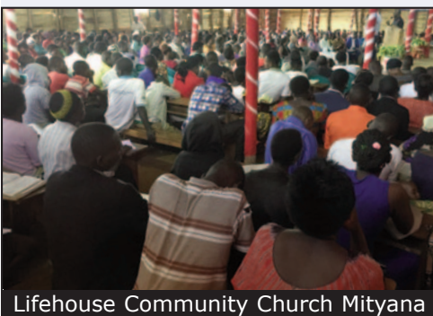
Lifehouse Community Church Mityana