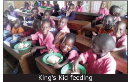
King's Kid feeding