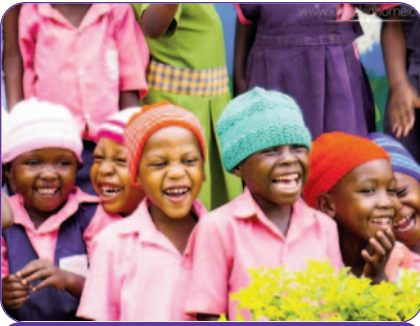
KING'S KID MINISTRIES PG. 2