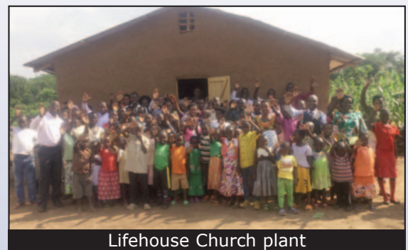
Lifehouse Church plant