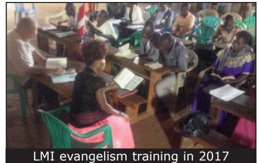
LMI evangelism training in 2017