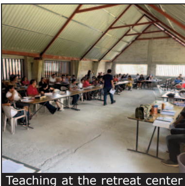
Teaching at the retreat center