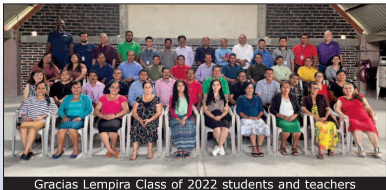
Gracias Lempira Class of 2022 students and teachers