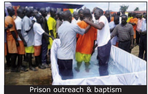
Prison outreach &amp; baptism