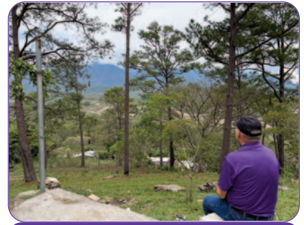
A NOTE FROM MARCIA PG. 4