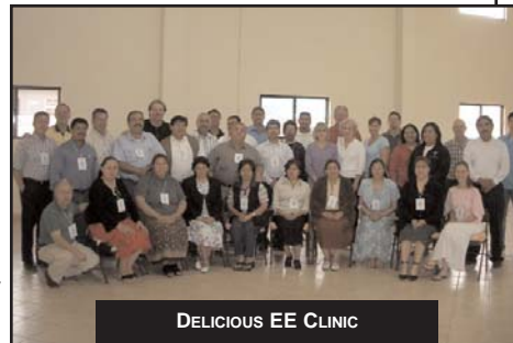
DELICIOUS EE CLINIC