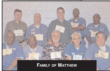
FAMILY OF MATTHEW

There is an extensive program for continuing discipleship that includes weekly meetings conducted by the prisoners for prisoners that have just completed Kairos. There are also monthly meetings with many of the "outside" ministry team coming back to encourage the prisoners in their new walk with the Lord.