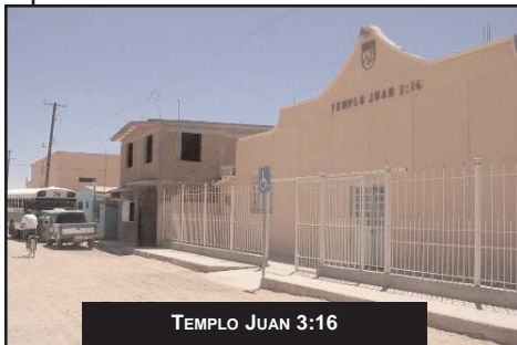
TEMPLO JUAN 3:16