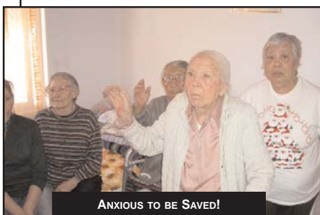
ANXIOUS TO BE SAVED!

On Tuesday the team visited the Good Samaritan retirement home. It is partly funded by the state, but mostly funded through private donations and was associated with a local church. All the team participated with the sharing of the Gospel with the results of 12 of the women (including several of the workers) receiving the gift of