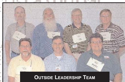
OUTSIDE LEADERSHIP TEAM