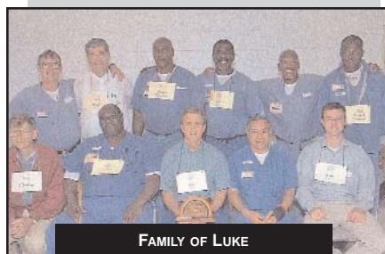
FAMILY OF LUKE

MATTHEW 25:43 I WAS ... IN PRISON, AND YOU DID NOT VISIT ME. VS. 44 "THEN THEY THEMSELVES ALSO WILL ANSWER, SAYING, 'LORD, WHEN DID WE SEE YOU ... IN PRISON, AND DID NOT TAKE CARE OF YOU?' VS. 45 "THEN HE WILL ANSWER THEM, SAYING, 'TRULY I SAY TO YOU, TO THE EXTENT THAT YOU DID NOT DO IT TO ONE OF THE LEAST OF THESE, YOU DID NOT DO IT TO ME.'