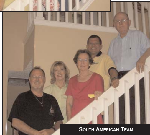
SOUTH AMERICAN TEAM