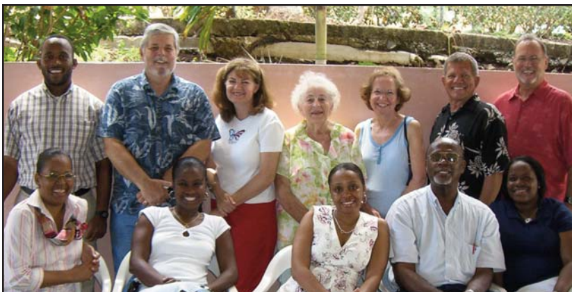
St. Thomas EE Clinic