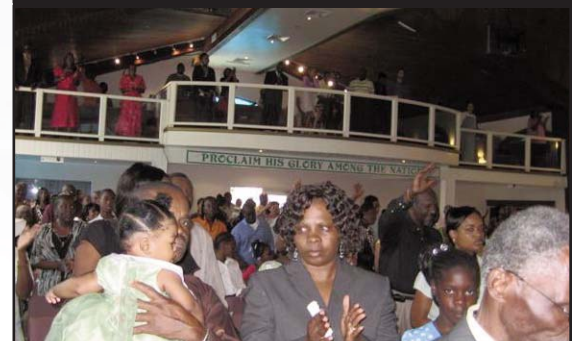
St. Thomas Assembly of God