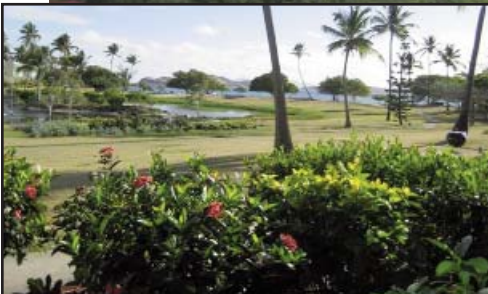
View of Caribbean from Room