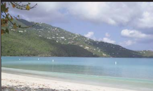
Megen's Bay Beach