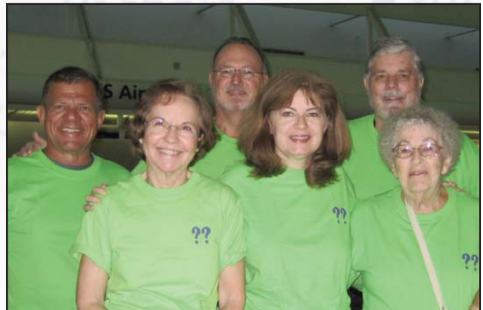
St. Thomas Travel Team

Additionally, we offer to take those equipped into various nations to equip