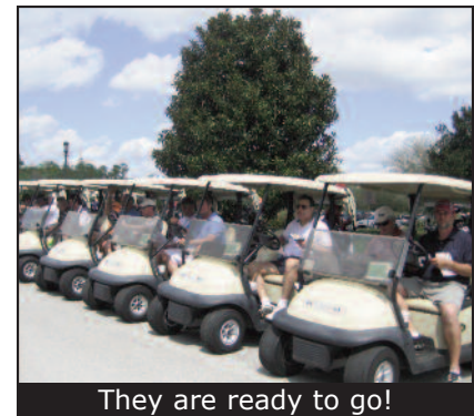
They are ready to go!