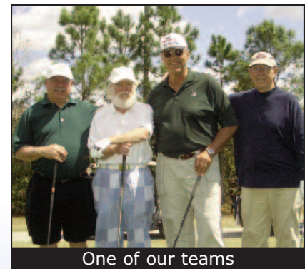
One of our teams