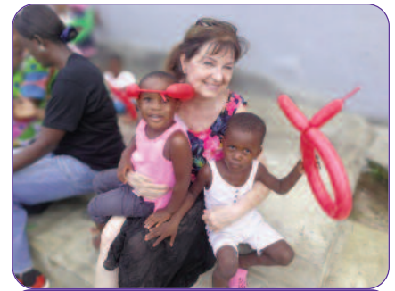
JUST THE FACTS