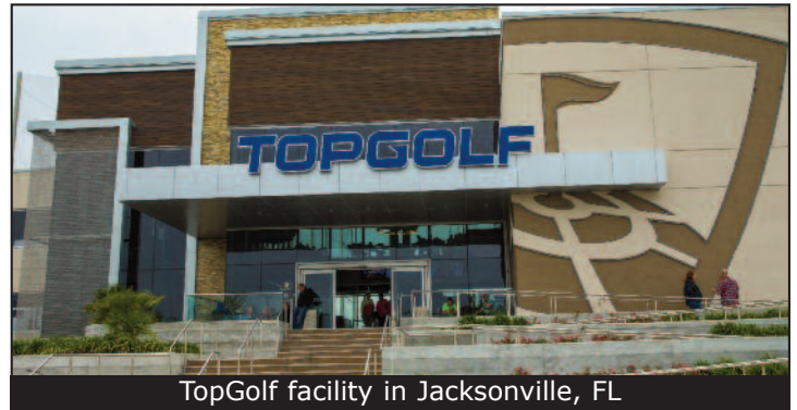
TopGolf facility in Jacksonville, FL