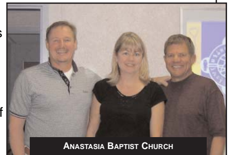
ANASTASIA BAPTIST CHURCH