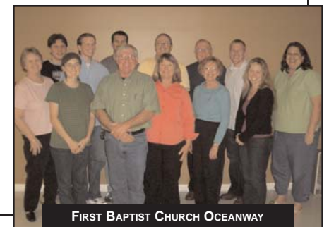
FIRST BAPTIST CHURCH OCEANWAY