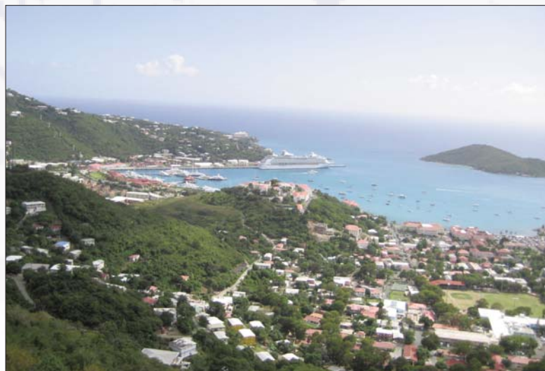
St. Thomas' Famous Cruise Ship Bay