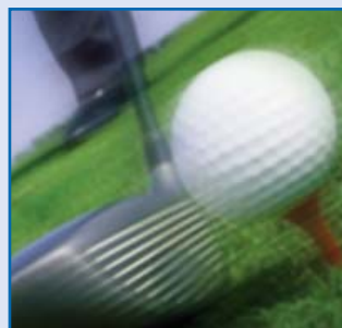
2007 Facts 4