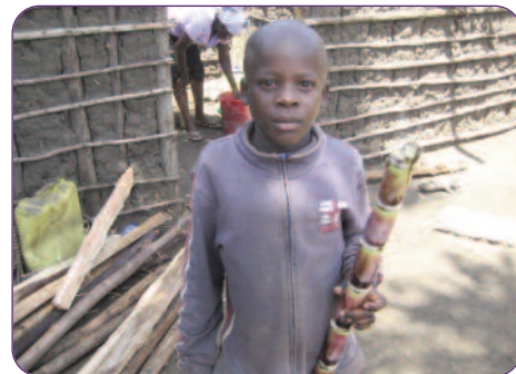
HELP IS NEEDED