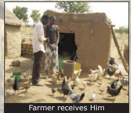
Farmer receives Him