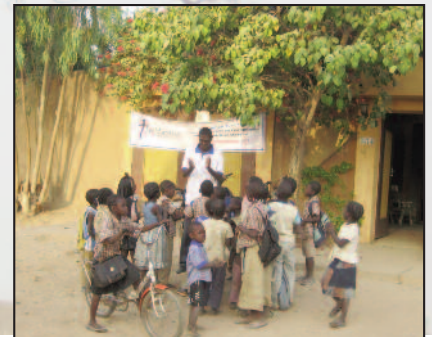
Children want to hear