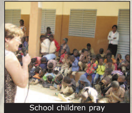
School children pray