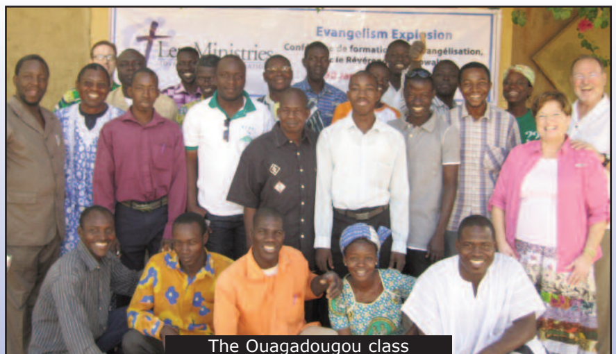
The Ouagadougou class