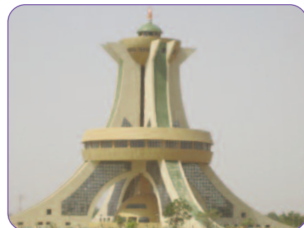
JUST THE FACTS