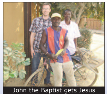
John the Baptist gets Jesus