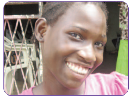
JUST THE FACTS