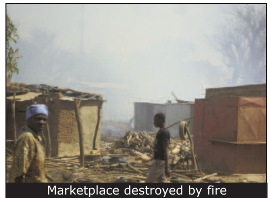
Marketplace destroyed by fire