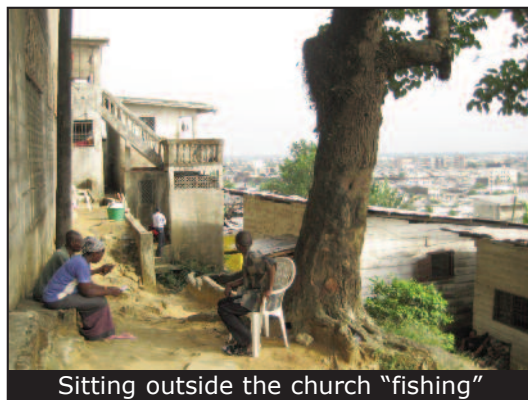
Sitting outside the church "fishing"