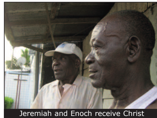
Jeremiah and Enoch receive Christ

has been raised in the care of the orphanage because she was born deaf and has not learned to speak.