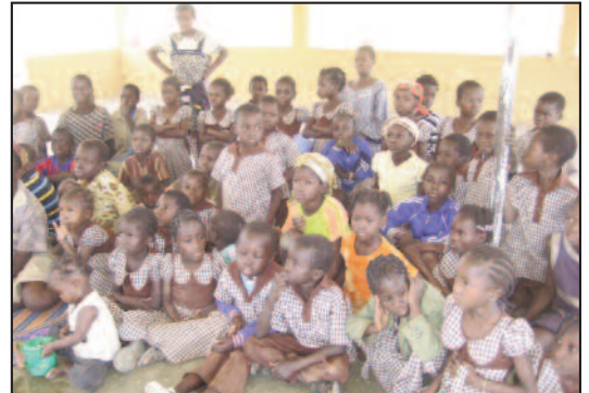
These orphans listened and prayed