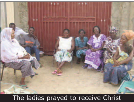
The ladies prayed to receive Christ