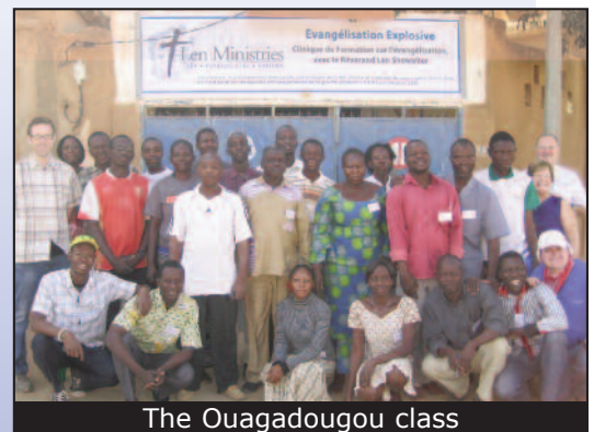
The Ouagadougou class