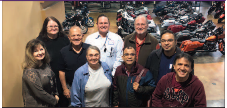
Jacksonville students & mentors