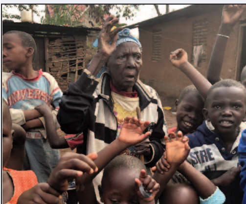
Who wants Jesus?