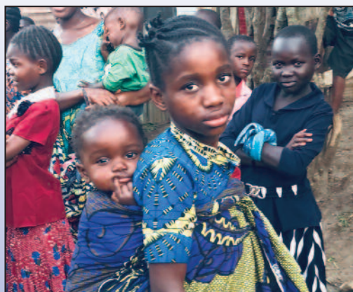
A young mother