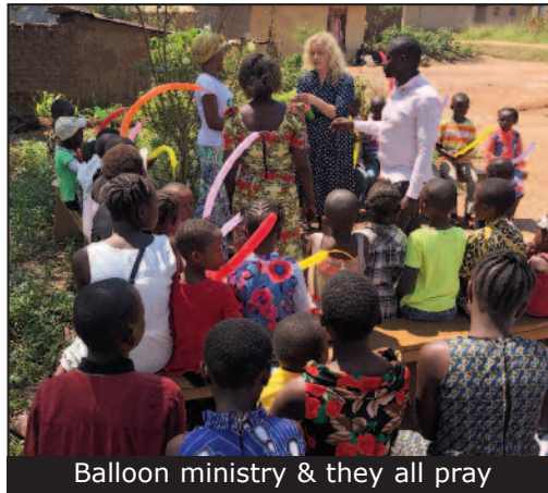
Balloon ministry & they all pray