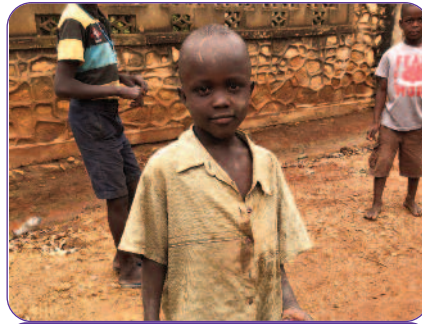
BUNIA, DR CONGO