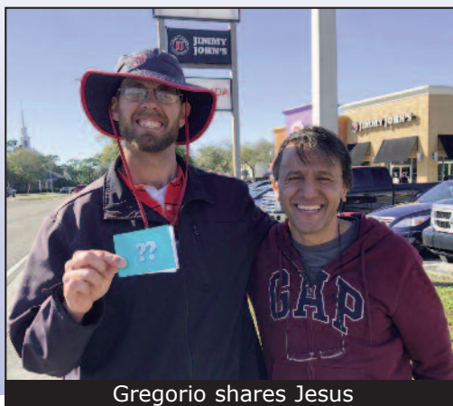
Gregorio shares Jesus