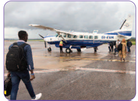
JUST THE FACTS