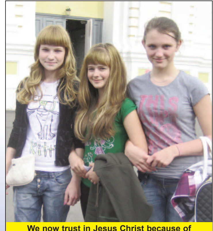
We now trust in Jesus Christ because of your help. Russia - June 2011