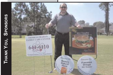
THANK YOU, SPONSORS

A great time was had by all and many are already looking forward to next year's fund raiser! (P.S.: One additional benefit of this tournament was that Len Ministries was able to donate $500.00 to the Hurricane relief effort.)