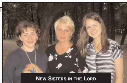
NEW SISTERS IN THE LORD

problem as when he went to open his luggage, he quickly discovered that it was not his, but a look-alike. It took several days to rectify this problem.