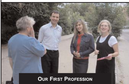
OUR FIRST PROFESSION