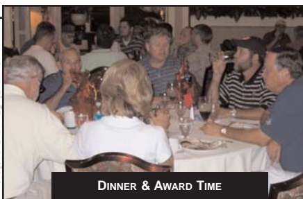
DINNER & AWARD TIME