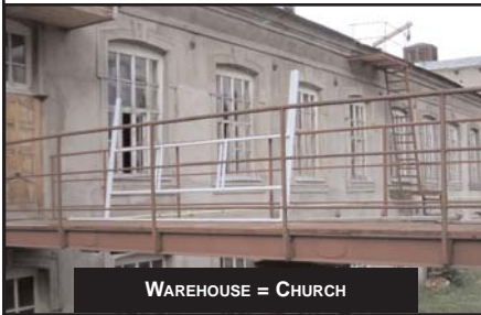
WAREHOUSE = CHURCH