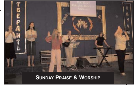
SUNDAY PRAISE & WORSHIP

problem as when he went to open his luggage, he quickly discovered that it was not his, but a look-alike. It took several days to rectify this problem.