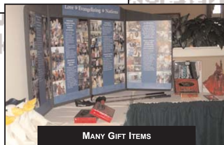
MANY GIFT ITEMS