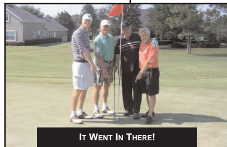
IT WENT IN THERE!

Raffle items were distributed and auction items were bid upon. And then the closest to the pin and longest putt awards were handed out.