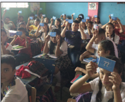
All these children received Christ