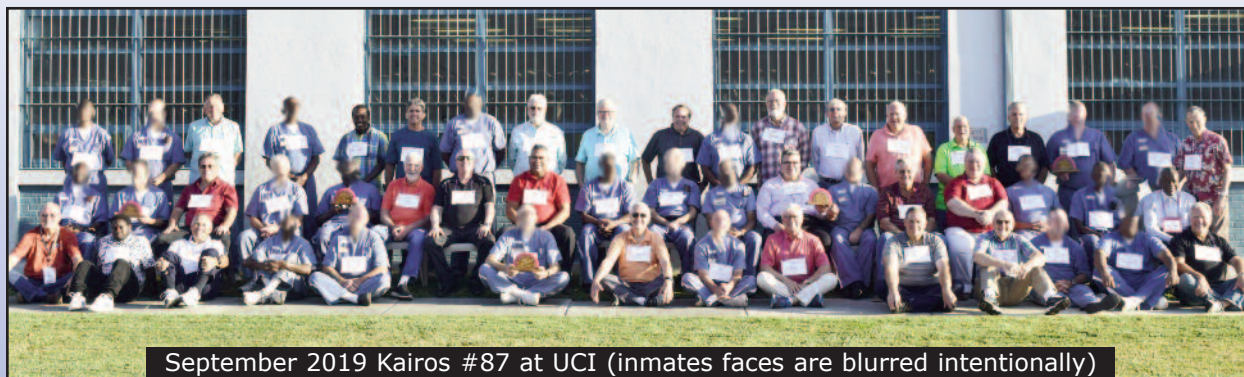
September 2019 Kairos #87 at UCI (inmates faces are blurred intentionally)