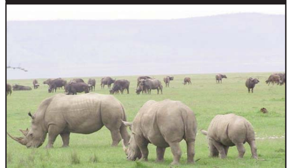
Nakuru National Park