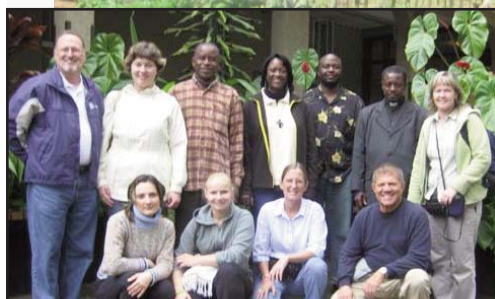
Americans, Russian, & Cameroonians