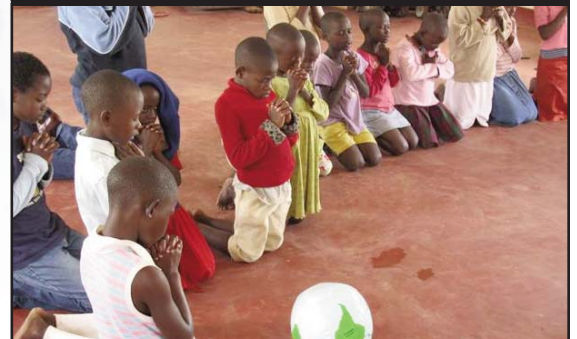
42 Prayed at the Orphanage