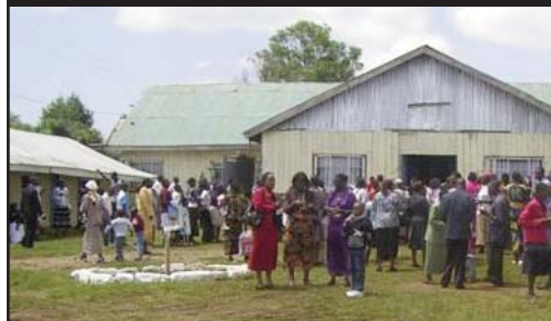
Grace Life Center