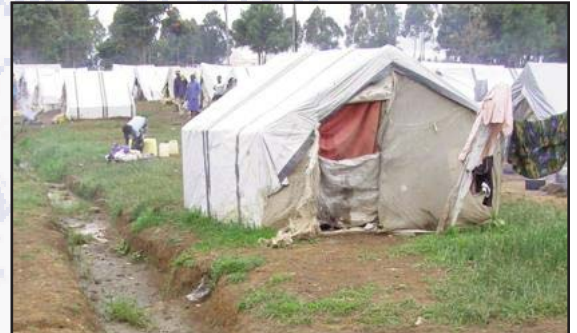
One of Several Relocation Camps

(Please see the “Just the Facts” article on page 4 for totals.)