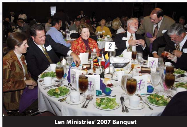
Len Ministries' 2007 Banquet

Business sponsorships and promotion are available for each of the tables at the banquet.