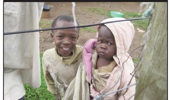
Some Were Leary of Us