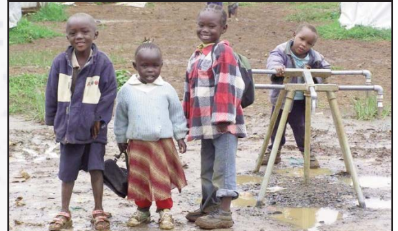
Drinking Water at the Relocation Camp