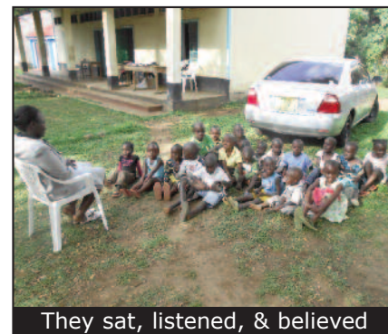
They sat, listened, & believed