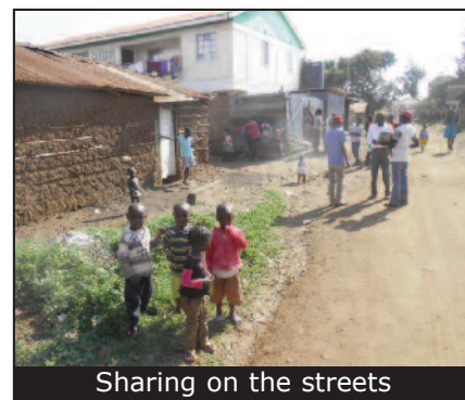
Sharing on the streets