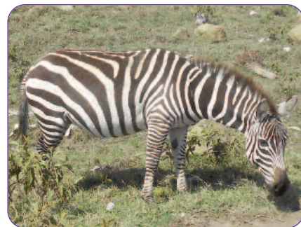
NOTE FROM US