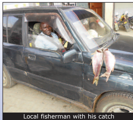
Local fisherman with his catch