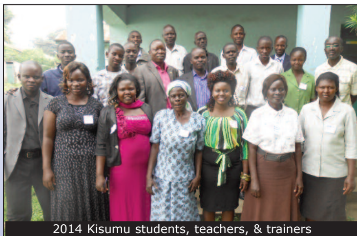
2014 Kisumu students, teachers, & trainers