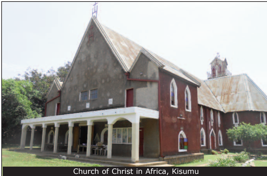
Church of Christ in Africa, Kisumu