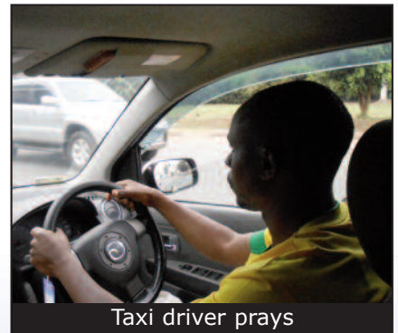
Taxi driver prays