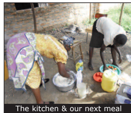
The kitchen & our next meal