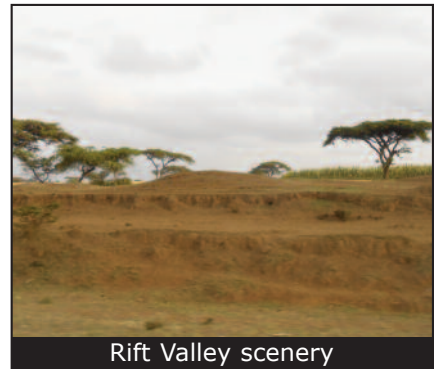
Rift Valley scenery