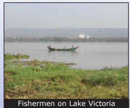
Fishermen on Lake Victoria