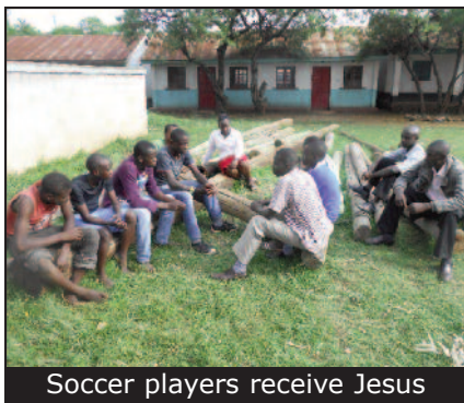
Soccer players receive Jesus