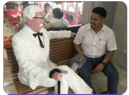
JUST THE FACTS PG. 4