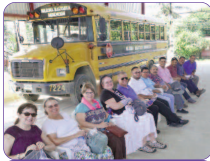
HONDURAS PG. 3