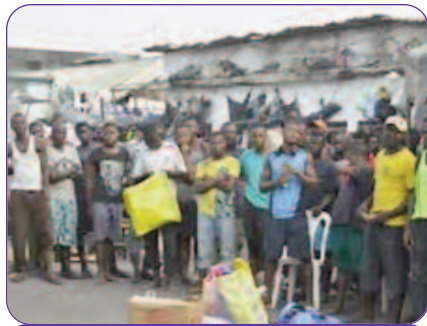
PRISON MINISTRY PG. 2