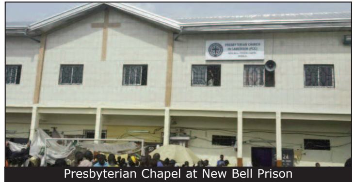
Presbyterian Chapel at New Bell Prison