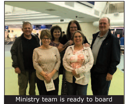
Ministry team is ready to board