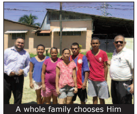
A whole family chooses Him