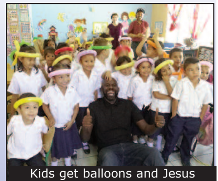
Kids get balloons and Jesus