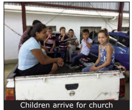
Children arrive for church