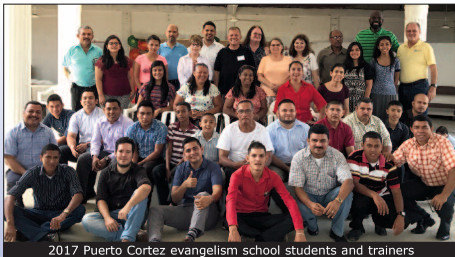
2017 Puerto Cortez evangelism school students and trainers