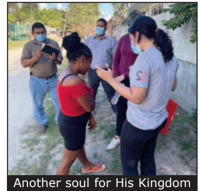
Another soul for His Kingdom