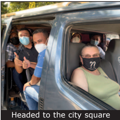
Headed to the city square