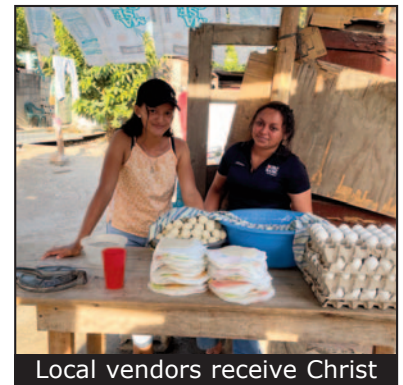
Local vendors receive Christ