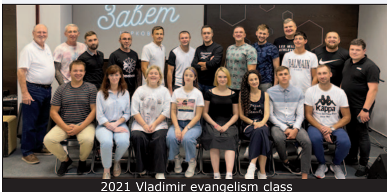
2021 Vladimir evangelism class