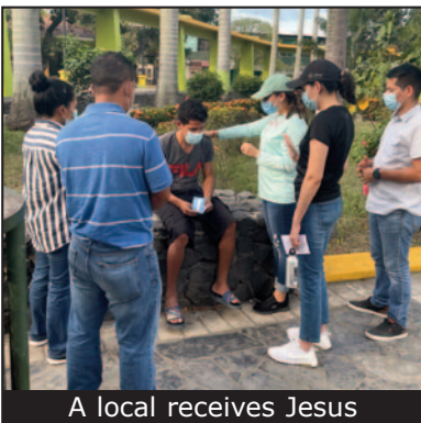
A local receives Jesus