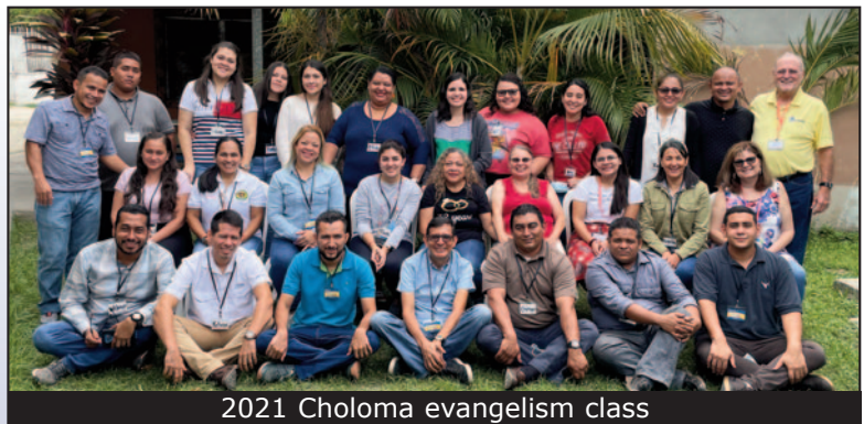
2021 Choloma evangelism class