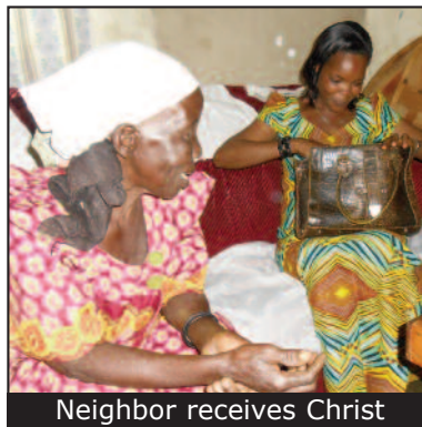
Neighbor receives Christ