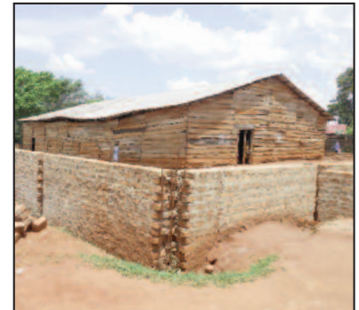
Lifehouse Community Church