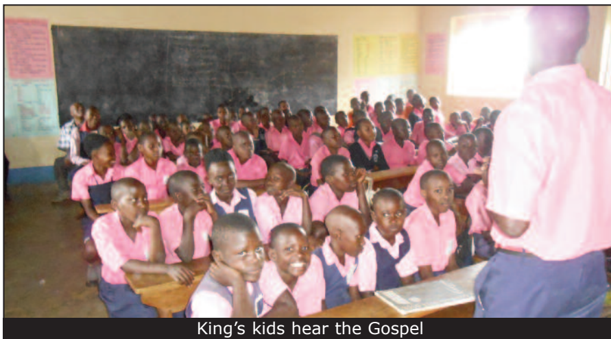
King's kids hear the Gospel