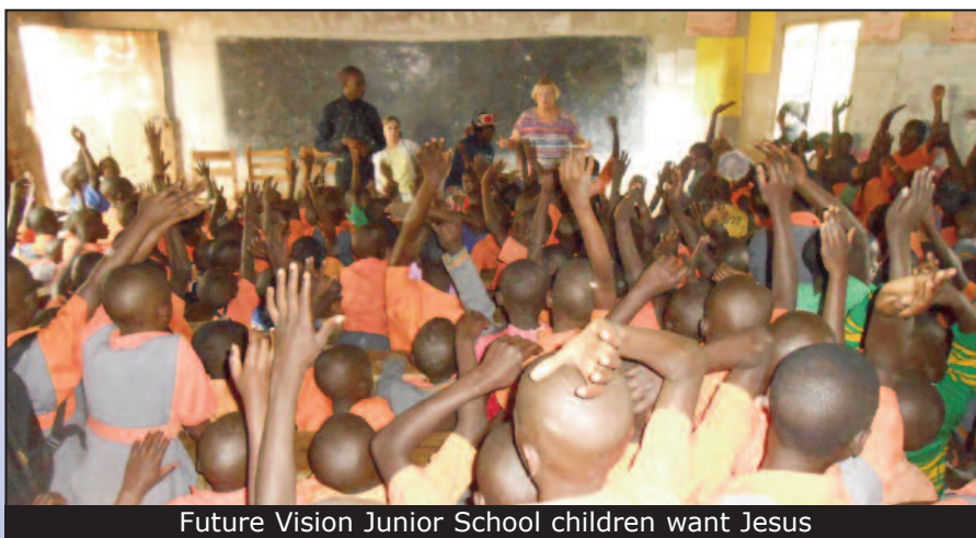
Future Vision Junior School children want Jesus