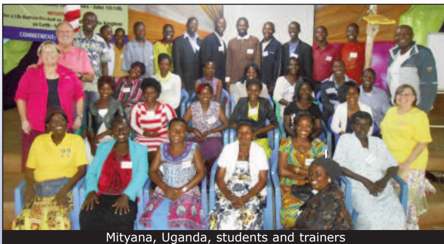
Mityana, Uganda, students and trainers