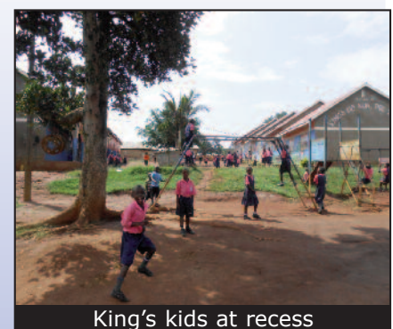
King's kids at recess