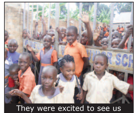
They were excited to see us