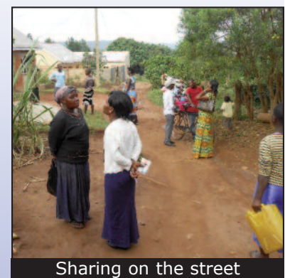
Sharing on the street