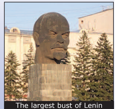
The largest bust of Lenin