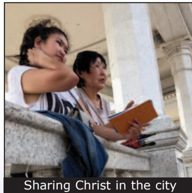
Sharing Christ in the city