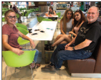
Two Muslim girls receive Christ