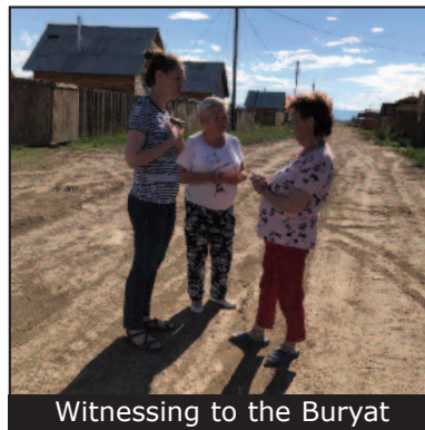
Witnessing to the Buryat