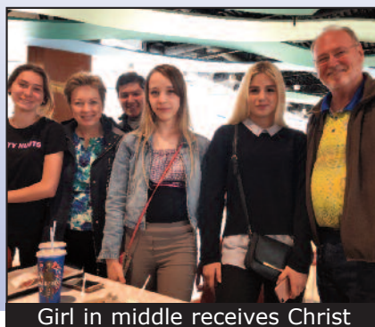
Girl in middle receives Christ