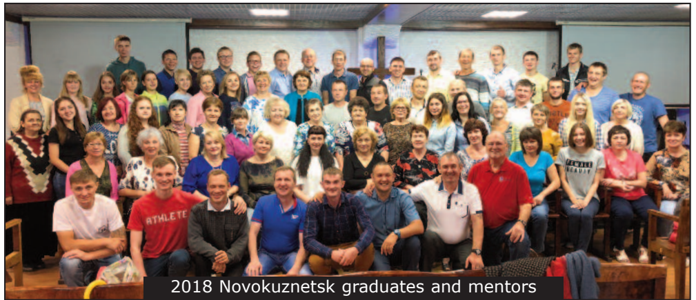
2018 Novokuznetsk graduates and mentors