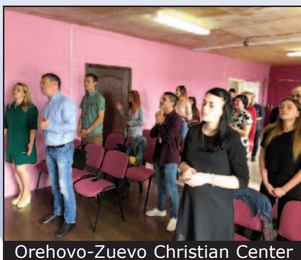
Orekhovo-Zuevo Christian Center