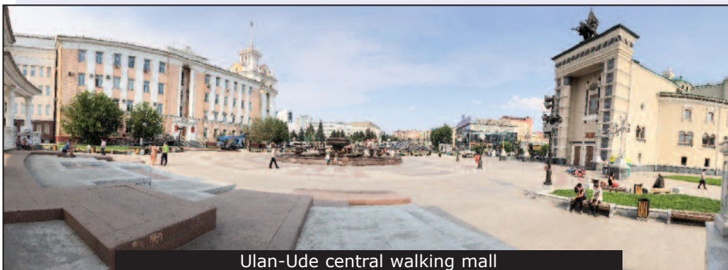
Ulan-Ude central walking mall