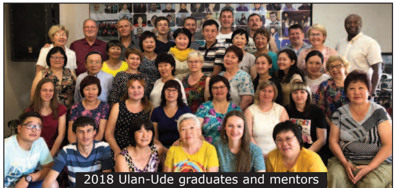
2018 Ulan-Ude graduates and mentors