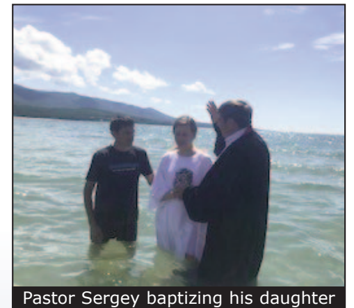
Lake Baikal retreat