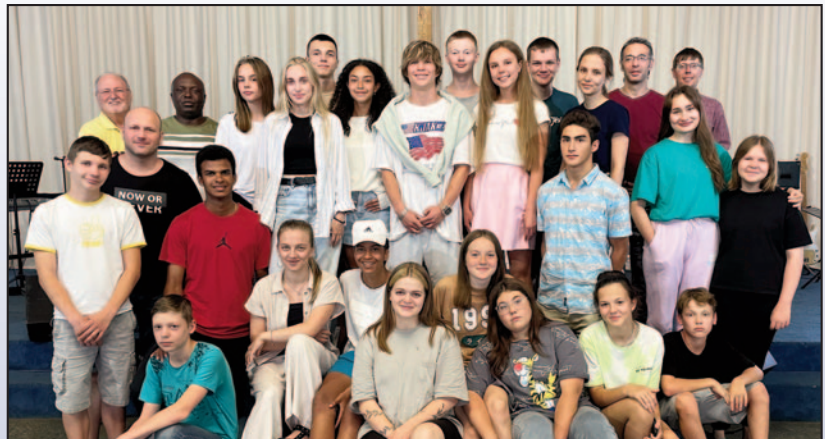
Ivanovo Class of 2022 students and teachers