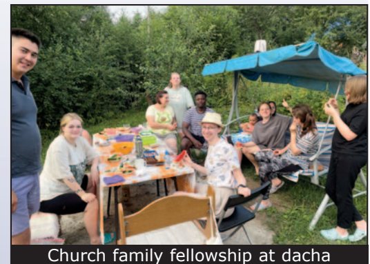
Church family fellowship at dacha