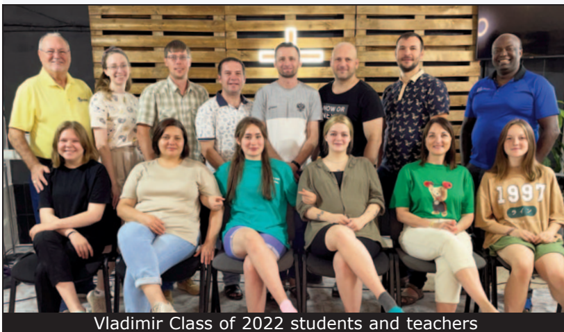
Vladimir Class of 2022 students and teachers