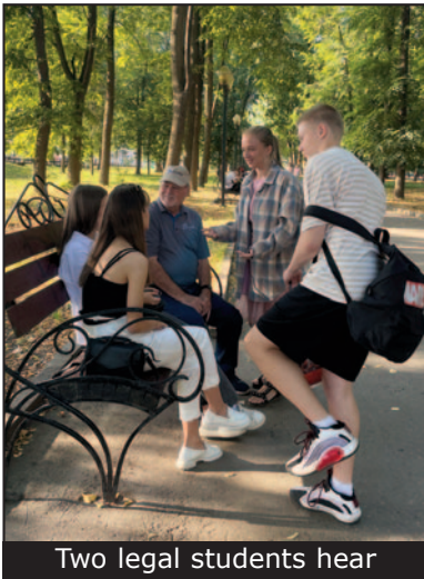
Two legal students hear