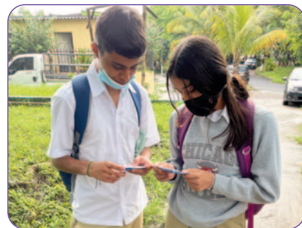
A NOTE FROM MARCIA