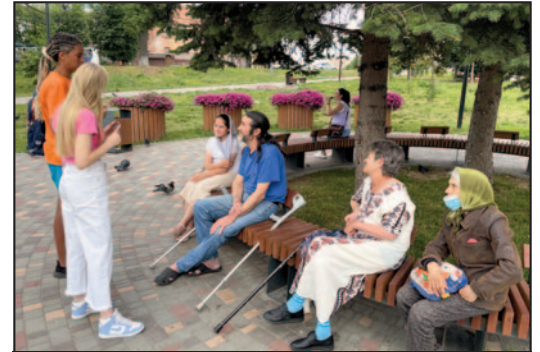
Witnessing by R.O. Cathedral