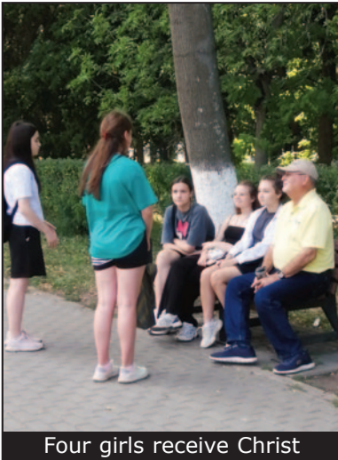
Four girls receive Christ