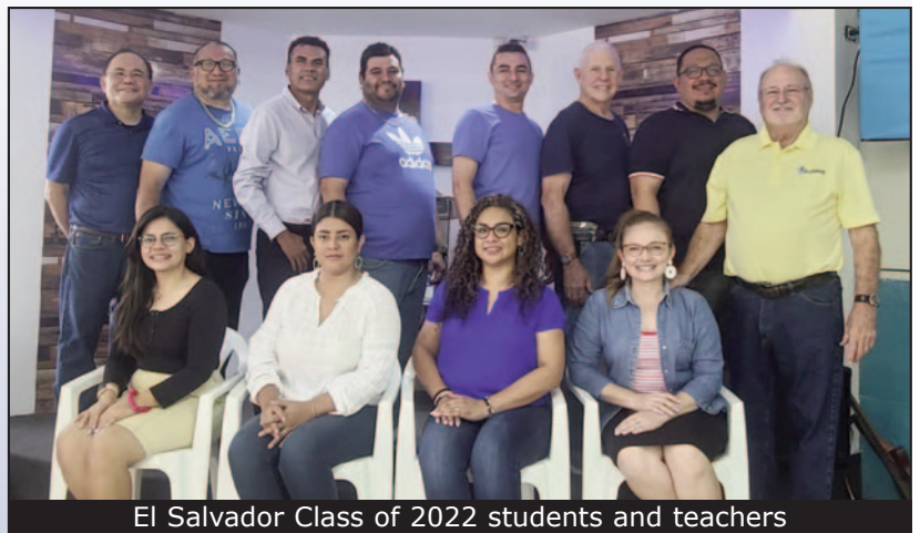
El Salvador Class of 2022 students and teachers