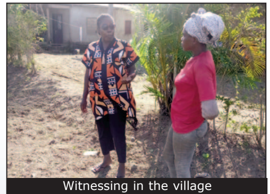
Witnessing in the village