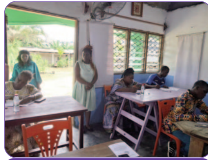
LMI IN CAMEROON