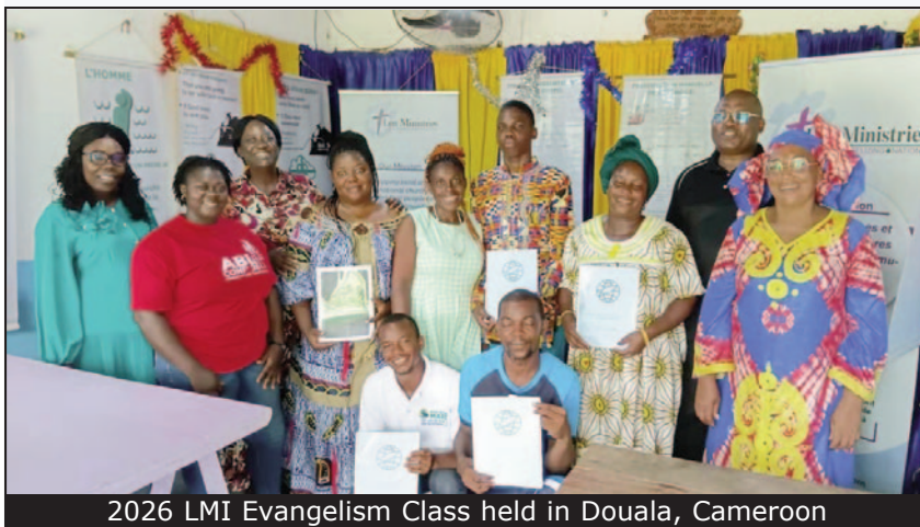
2026 LMI Evangelism Class held in Douala, Cameroon