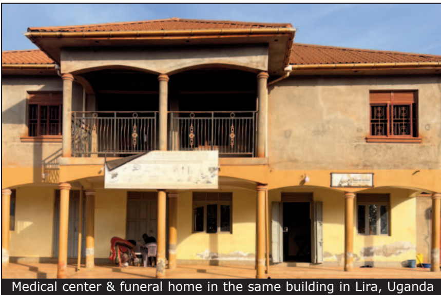
Medical center & funeral home in the same building in Lira, Uganda