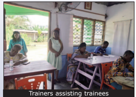
Trainers assisting trainees