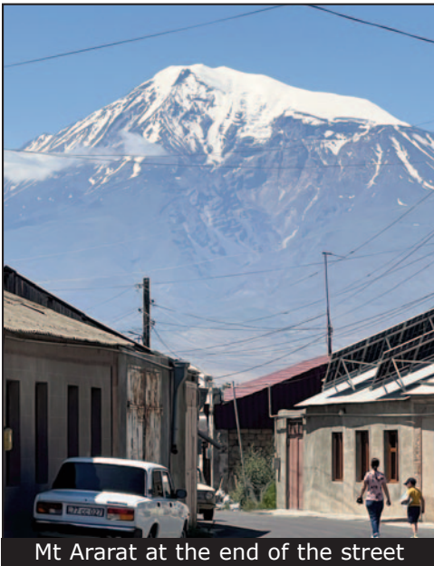
Mt Ararat at the end of the street

Please contact us at Len Ministries at (904) 535-4658 if you would like to join us in going. We would be glad to answer any question and assist you or your church to prepare for a successful summer mission trip. LMI