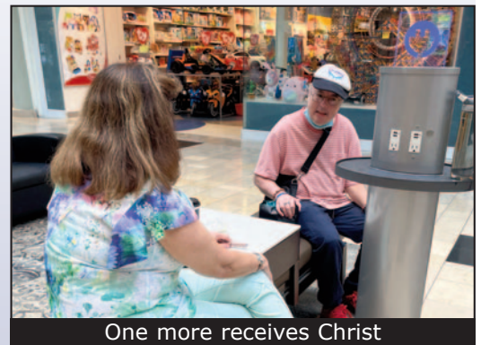
One more receives Christ