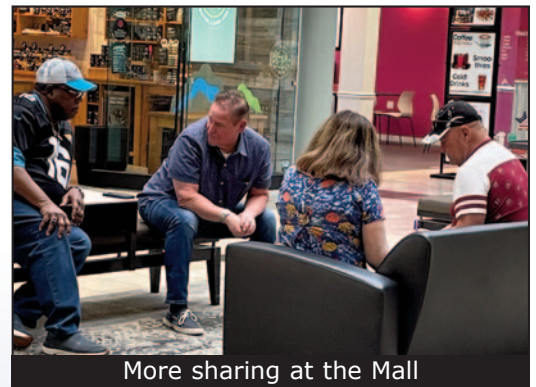
More sharing at the Mall