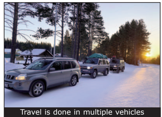
Travel is done in multiple vehicles