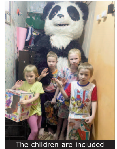
The children are included