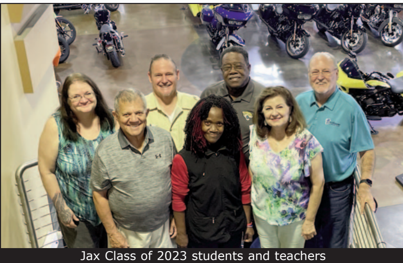
Jax Class of 2023 students and teachers