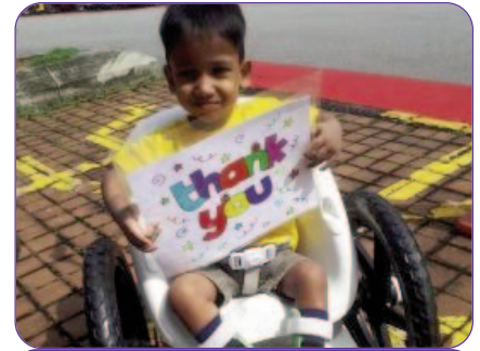
A NOTE FROM MARCIA