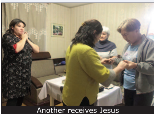
Another receives Jesus