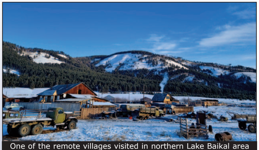
One of the remote villages visited in northern Lake Baikal area