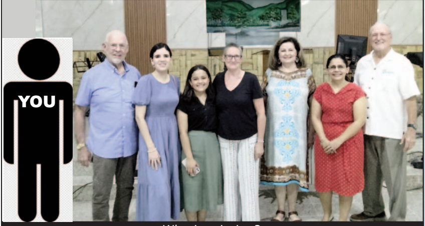
Who is missing?