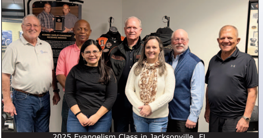
2025 Evangelism Class in Jacksonville,