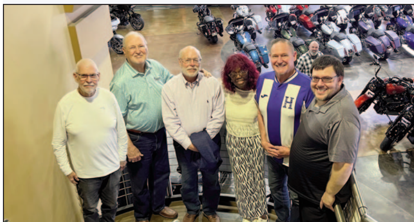
2026 Jax Evangelism Class at Adamec Harley/Davidson