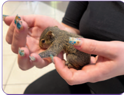
JACKSONVILLE, FL PG. 3