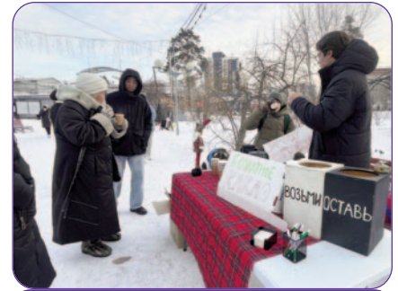
A NOTE FROM MARCIA PG. 4