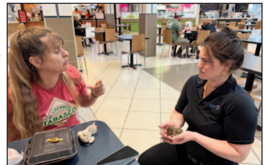
Lady on left received Jesus and the worker received a squirrel!