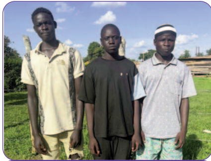
MISSION TRIPS PG. 2